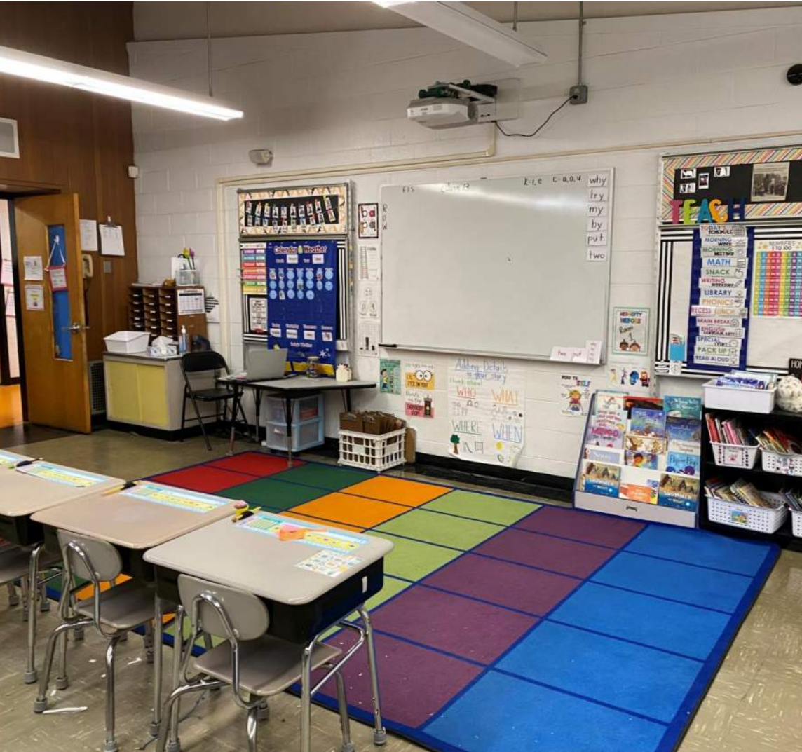
Cushing Elementary School - Classroom