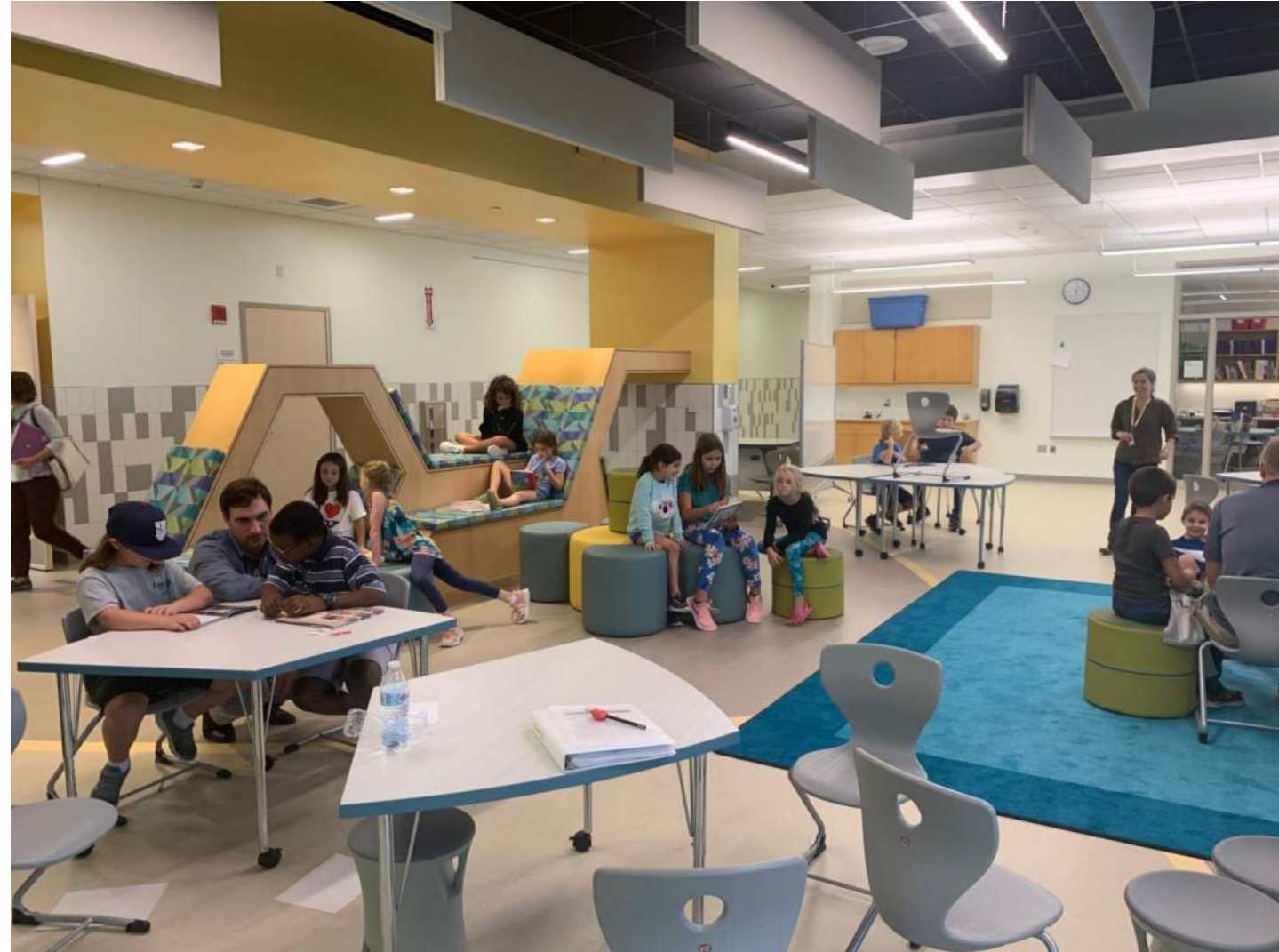
S.L. Williams Elementary School - Extended Learning