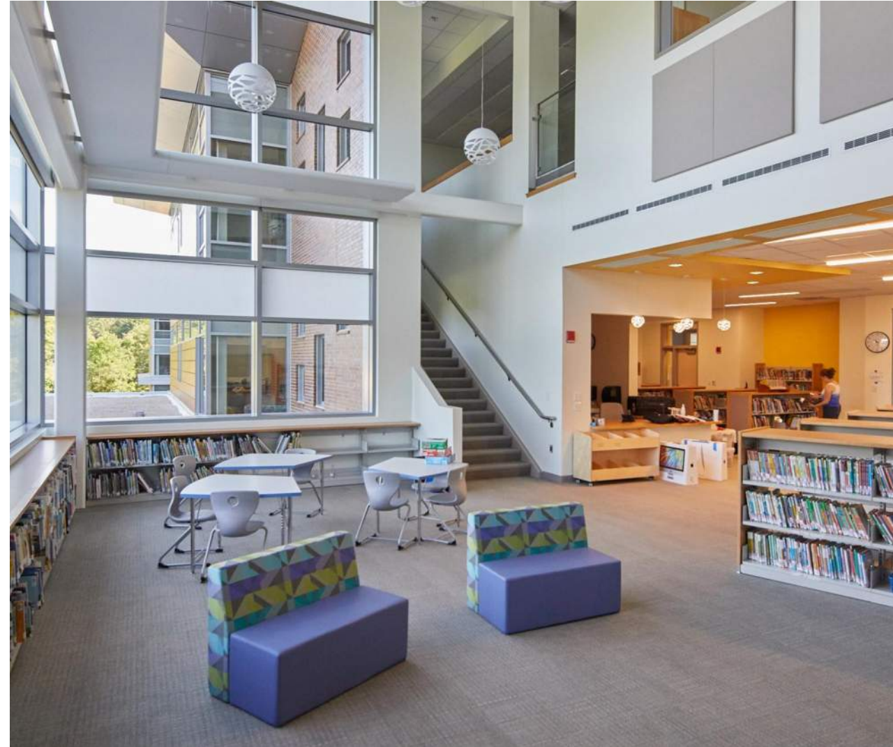
Sunita L. Williams Elementary School - Library