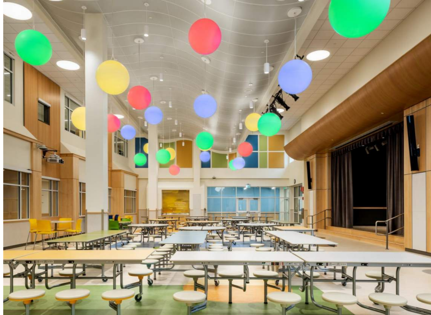
Northbridge Elementary School Cafeteria