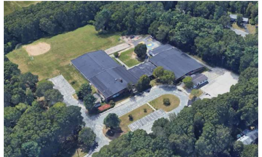
Cushing Elementary School – 1964 ( 59 yrs )