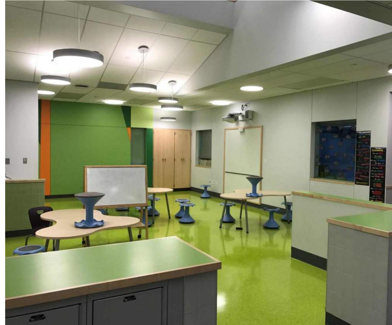
Woodland ES, Milford Extended Learning SMMA Architects