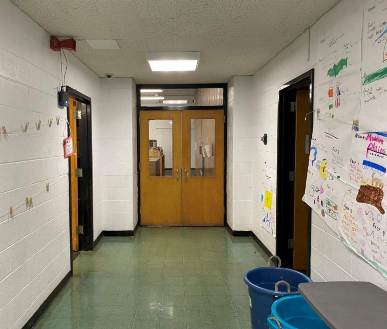
Cushing Elementary School - corridor