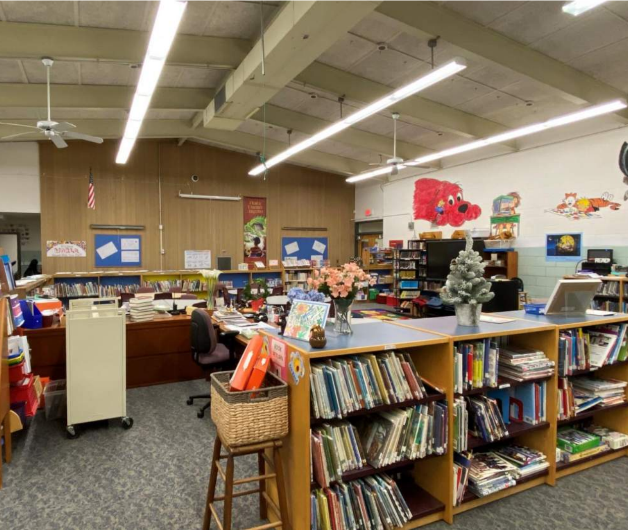
Hatherly Elementary School - Library