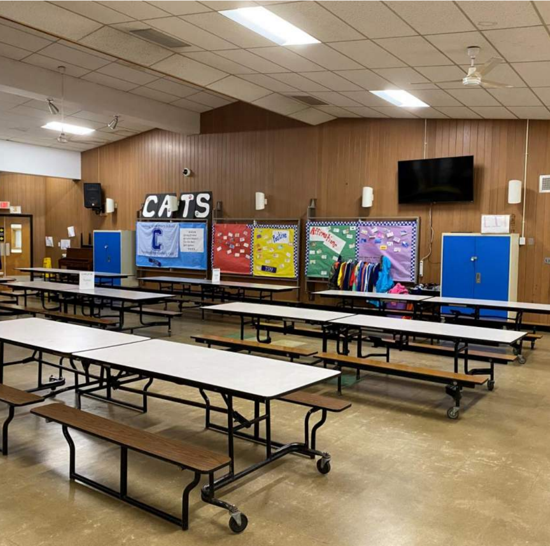
Cushing Elementary School - Cafeteria