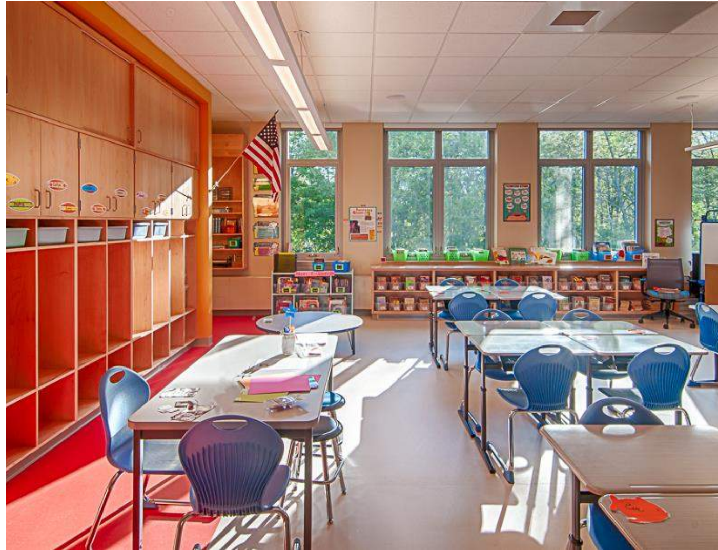
West Parish Elementary School