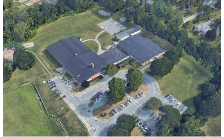
Hatherly Elementary School – 1962 ( 61 yrs )